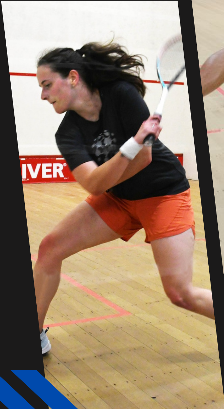
x x x x x x x x x x x x x x x x