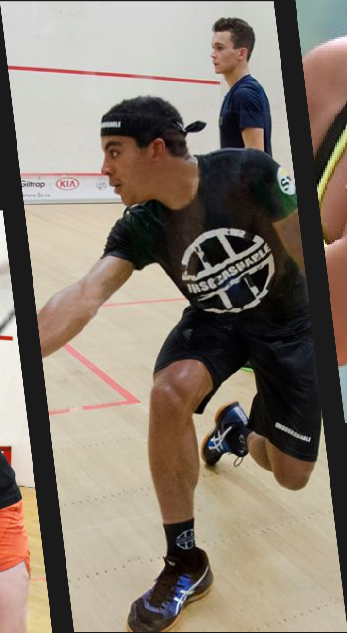
x x x x x x x x x x x x x x x x